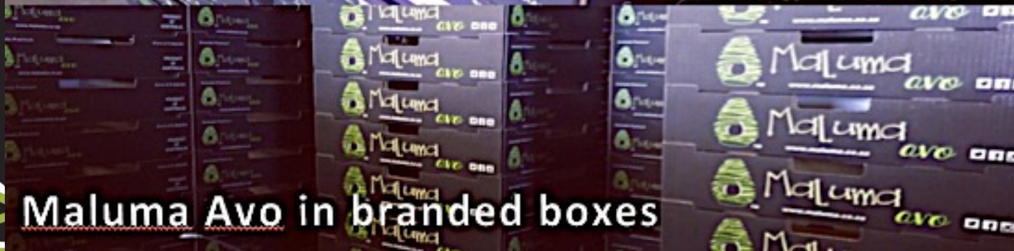
Maluma Avo in branded boxes